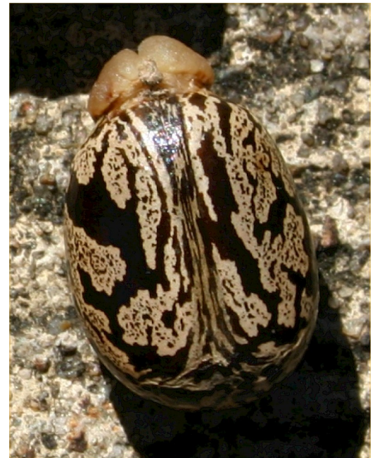
Poisonous seed from inside capsule.